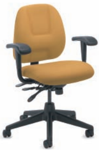
TI013 Mid Back Shown with adjustable arms