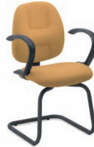
TI310 Guest Shown with open loop arms, sled-base