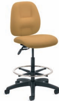
TI211 Stool Shown armless, draft height