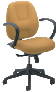
TI524 Conference Shown high back with open loop arms