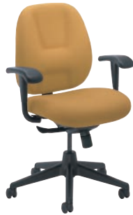
TI022 High Back Shown with adjustable arms