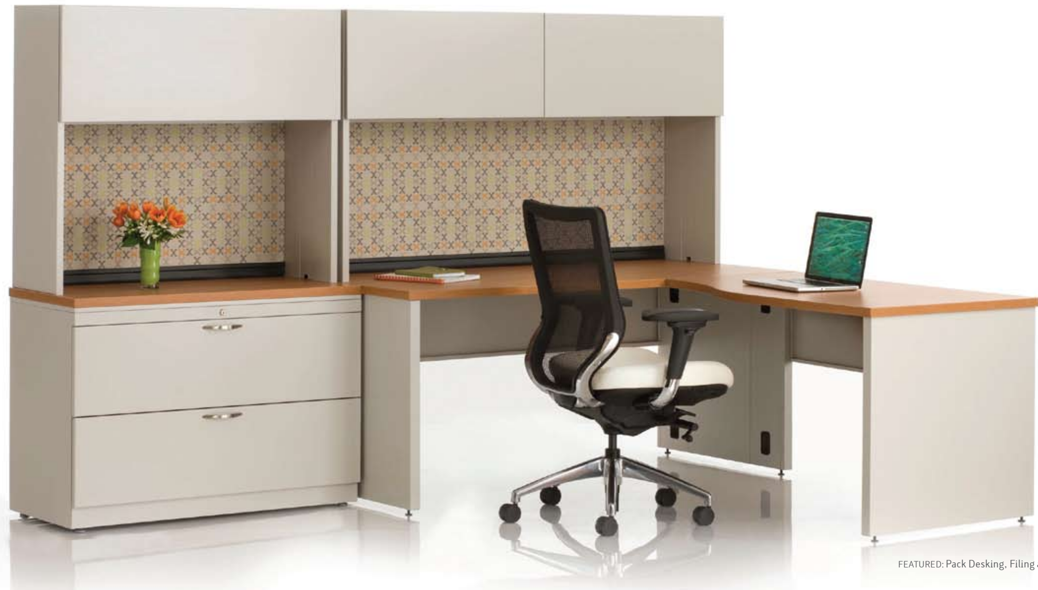
FEATURED: Pack Desking, Filing and Storage; Code® seating.